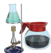
Lab, Office & Hospitality Supplies