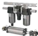
Pneumatics & Hydraulics