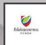
PT. Bhimasena Power - Indonesia