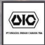
Unggul Indah Cahaya Tbk., PT