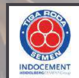
PT. Indocement Tunggul Prakarsa