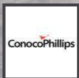
Conocophillips Indonesia Inc Ltd