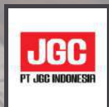
PT. JGC Corporation