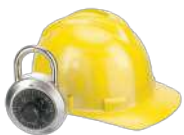
Safety & Security

"Grainger is a leading business-to-business distributor headquartered in the U.S. Grainger.com provides access to maintenance, repair, and operating (MRO) supplies for over a million customers around the world." We've been partnered for 10+ years and capable providing the guidance to relevant products, services and solutions to help keep your facilities safe and running efficiently. With over 1 million products from more than 5,000 brands to help ensure you have just what you need to get the job done.