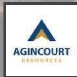
PT. Agincourt Resources