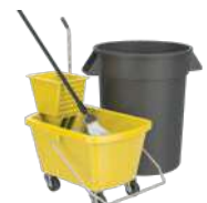
Cleaning & Janitorial