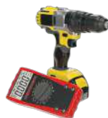
Test Instruments & Tools