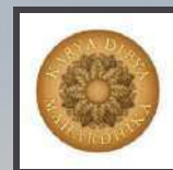
PT. Karya Dewa Mahardika