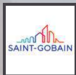
PT. Saint Gobain