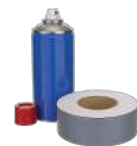
Tapes, Adhesives & Lubricants