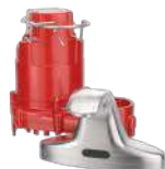
Plumbing & Pumps