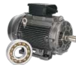
Motors & Power Transmission