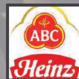
PT. Heinz Abc Indonesia