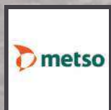
PT. Metso Minerals Indonesia