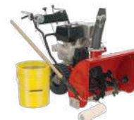
Building & Grounds Maintenance