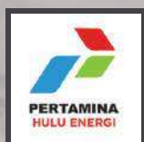
Pertamina Hulu Energi, PT